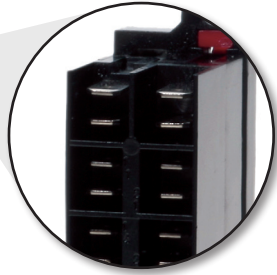
Detail of connections