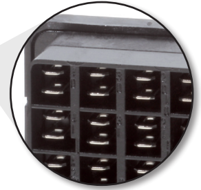
Detail of connections